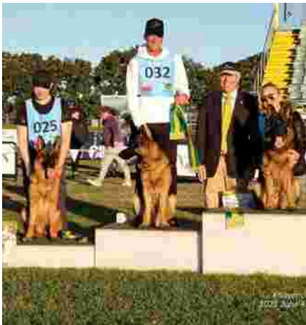
Chips on the podium in 2 nd place

To top this off he won Winner of Winners, which is where the first placed dogs in all Obedience categories compete against each other in a shortened, off lead obedience pattern and the best performance is awarded the Winner of Winners.